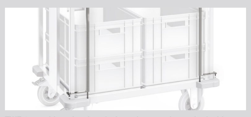
TWE 6 x 4 with optional push-through protection on both sides